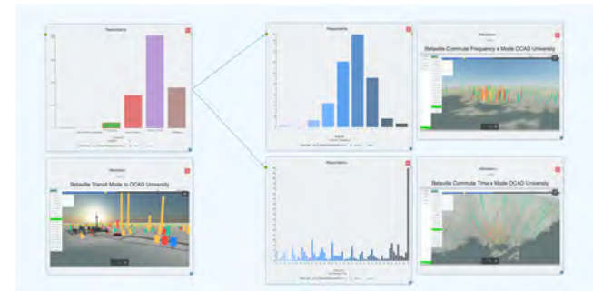
Fig. 3: Each 3D column visualization is coupled with a bar chart, representing the distribution of respondents by institutions with “OCAD University” selected as the subset. This representation illustrates Transit modes, Commute frequency and Commute time for OCAD University students. The bar charts generated in Story Facets give aggregate quantitative information, while the 3d visualization gives a corresponding spatial understanding, therefore enhancing the qualitative dimension of the data.

Betaville's interactive 3D spatial navigation of vertical bar graphs as an overlay on a map of the city provided for improved legibility and pattern recognition for expert and non-expert users alike: the very different patterns of travel distance and mode choice between the participating schools could make it immediately clear that the challenges are very different from institution to institution. The aggregate data reveals pattern trends at the municipal level, where the information is relevant to zoning and land use near the schools, and to transit planning across the metropolitan region. Blending 2D cartographic representation and interactive 3D infographics captured the information value of both types, without distorting either. [Fig. 2].